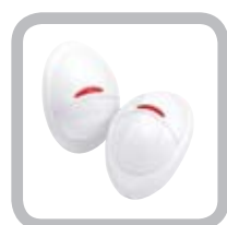
NEXT/ K-985 MCW

PIR motion sensors should be sited to ensure that they do not face into direct sunlight, windows, strong sources of heat and cold (i.e. heaters, radiators, cold drafts or ventilators). They should also