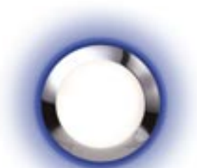
Chrome body with blue back light