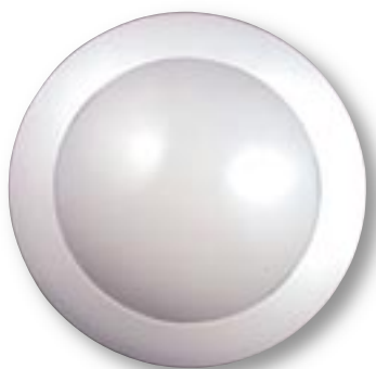
White body with red back light