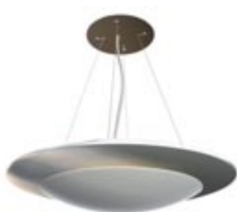
Wire Drop Pendant