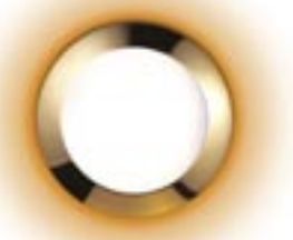
Brass body with amber back light