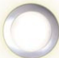
White body with white back light